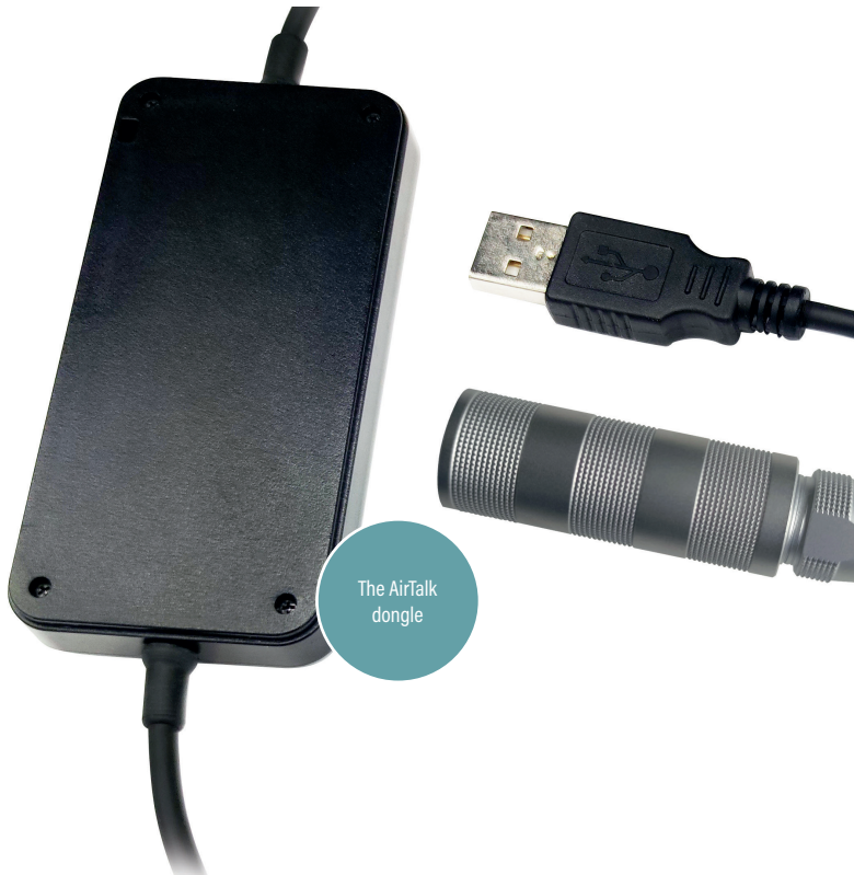
The AirTalk dongle