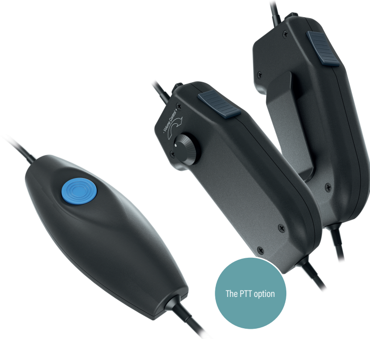
The PTT option

Furthermore, Imtradex provides a classic hand microphone. HT-2 is a cylindrical shaped device. Made of aluminium it is rugged and robust. The PTT button is easy to reach. The device can be easily fitted to the VCS system of the customer choice and with the correct connector. There are plenty of customization options. Together with the latest USB technology the HT-2 can also be easily used in the simulation area.